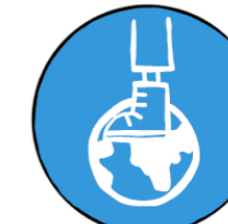
Impact on the World