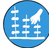
Food and Farming