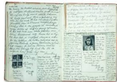
Anne Frank's diary