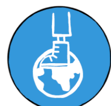
Impact on the World