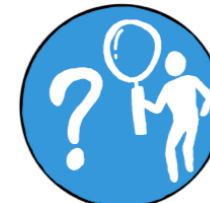
Clues from the Past