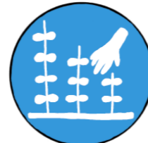
Food and Farming