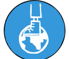
Impact on the World